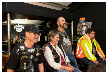
At least some seem amused